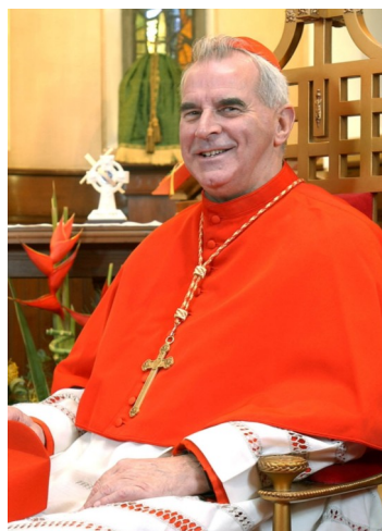
His Eminence Cardinal Keith Patrick O'Brien